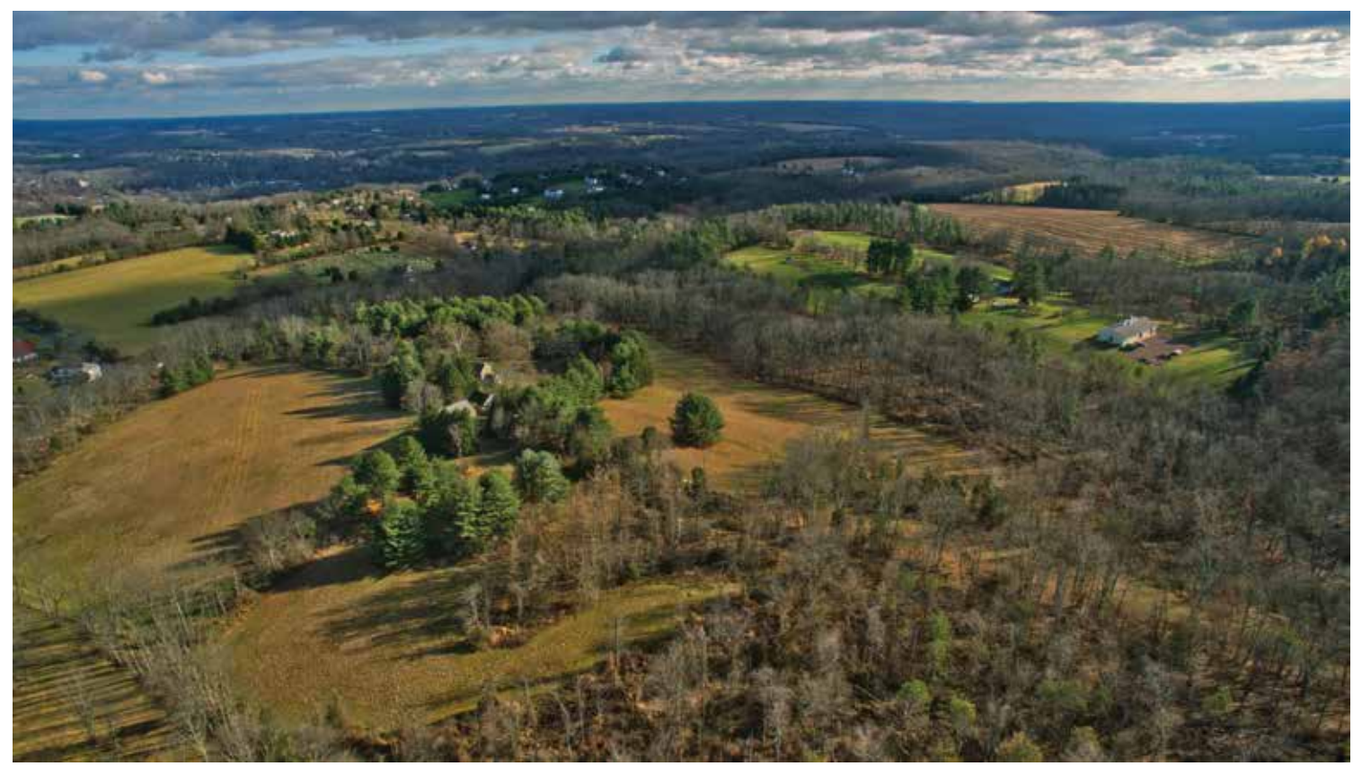
Can the removal of oil and gas leases in our area lead to more conservation successes that look like this? See page 5 to read about how this part of Tinicum has reached 1,165 contiguously preserved acres—and counting!