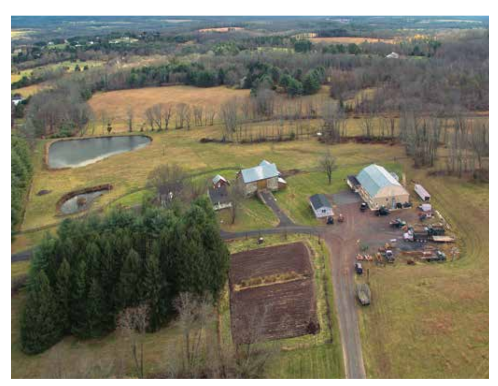
Looking south from Chris Weaver's farm. Its protection means another 64 acres will remain in agricultural use.

Erwinna farm means that there are now 1,165 acres preserved along, and on both sides of, Upper Tinicum Church Road from Geigel Hill to Red Cliff Roads. All the large properties in that area, except for one, are now preserved in perpetuity. A true conservation success!