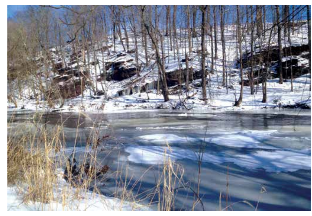
The Tohickon Creek, an exceptional value.

symptoms, and a list of local arborists)